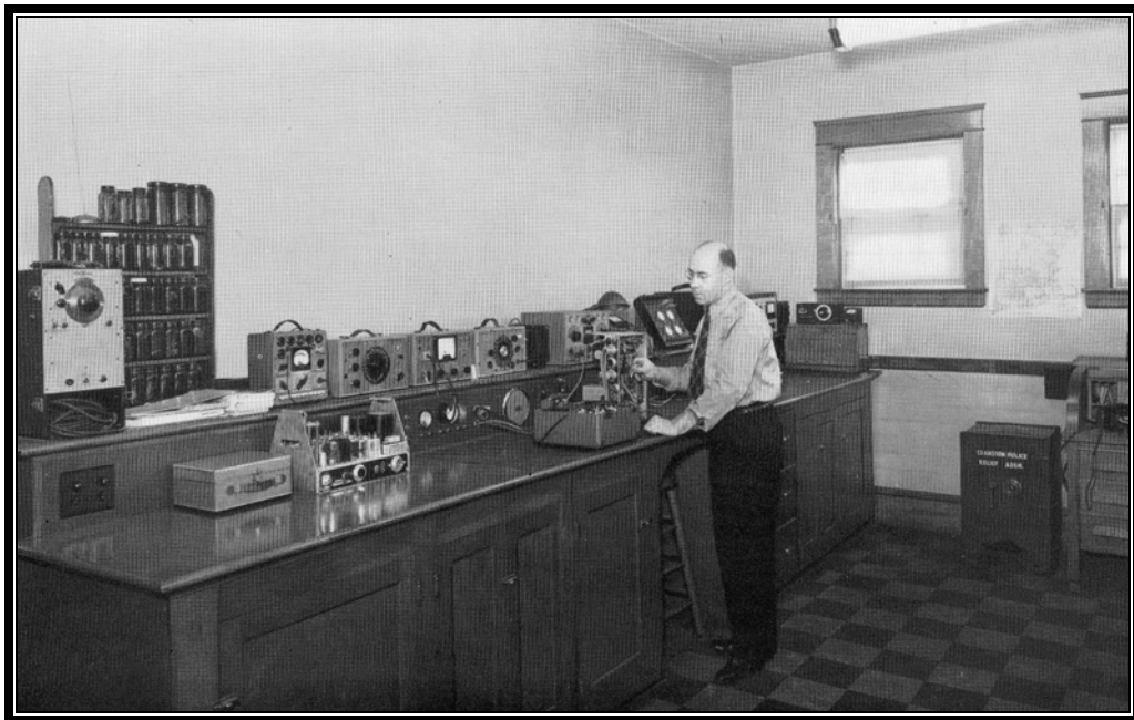
Chief Radio Operator Stanley W. Atkinson Servicing police radios, circa 1953

In 1940 the department upgraded the radios in patrol cars to a two-way, AM band type. In 1948 the first two-way FM radios were installed. These were a vast improvement over the old AM radios, yet due to the topography of the city, certain areas remained “dead spots” well into the 1970’s.