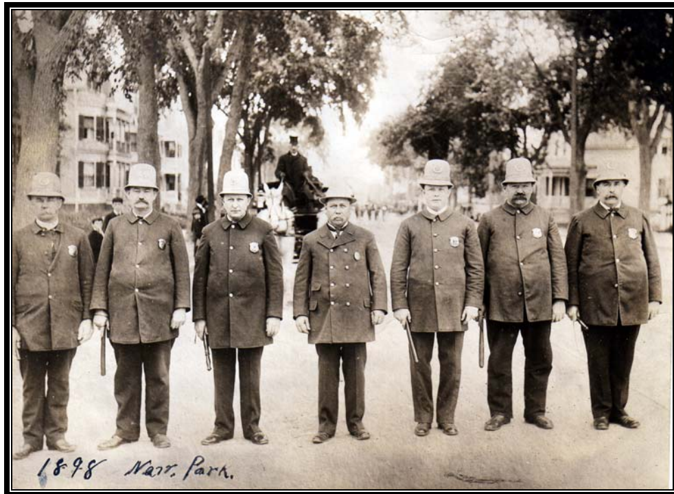
Cranston Police Officers, 1898