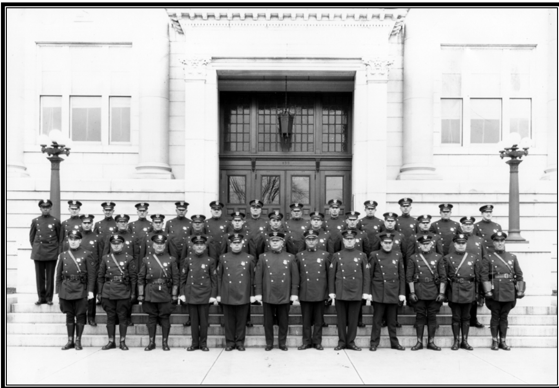
Cranston Police Department, 1929

Since 1910, the permanent department had continued to appoint special or part-time officers. Records show, that by 1920, the list of Special Officers included over 200 names!