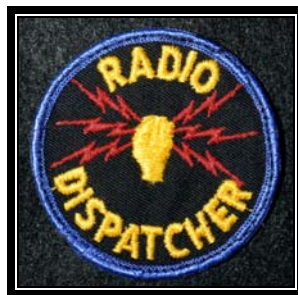
Dispatcher uniform patch

1976 saw the implementation of a new three-channel radio dispatch system. This was another major technological step at a time when many Rhode Island police departments were still sharing radio frequencies. The following year eight civilian dispatchers are hired to free some patrolmen from working in dispatch.