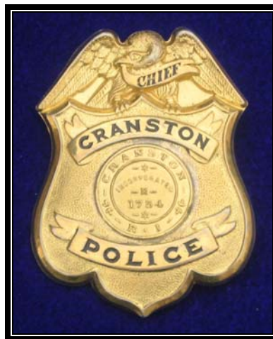
Chief's badge 1909

The new city government lost no time in establishing a permanent police department consisting of a chief and ten patrolmen. At that time, the offices of Town Sergeant and Chief of Police were merged into one to centralize the department.