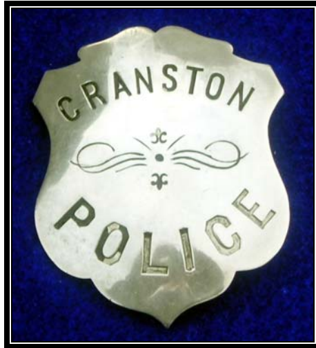
Early Cranston Police Badge

Even though it would seem that the frequent turnover of town sergeant's offered little stability, the system apparently worked, as it was used for more than 100 years.