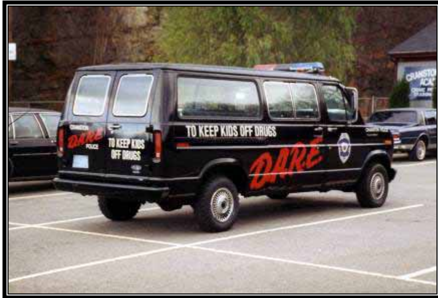
Rear View of DARE van 1995