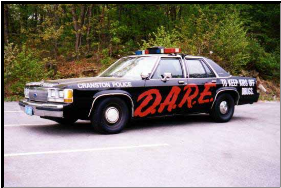
DARE Officer's car, a 1990 Ford.