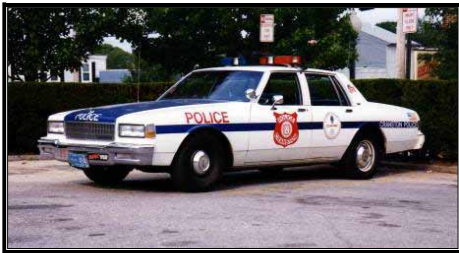
First DARE vehicle, a 1987 Chevrolet.