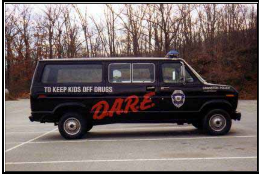
DARE van, a 1987 Ford