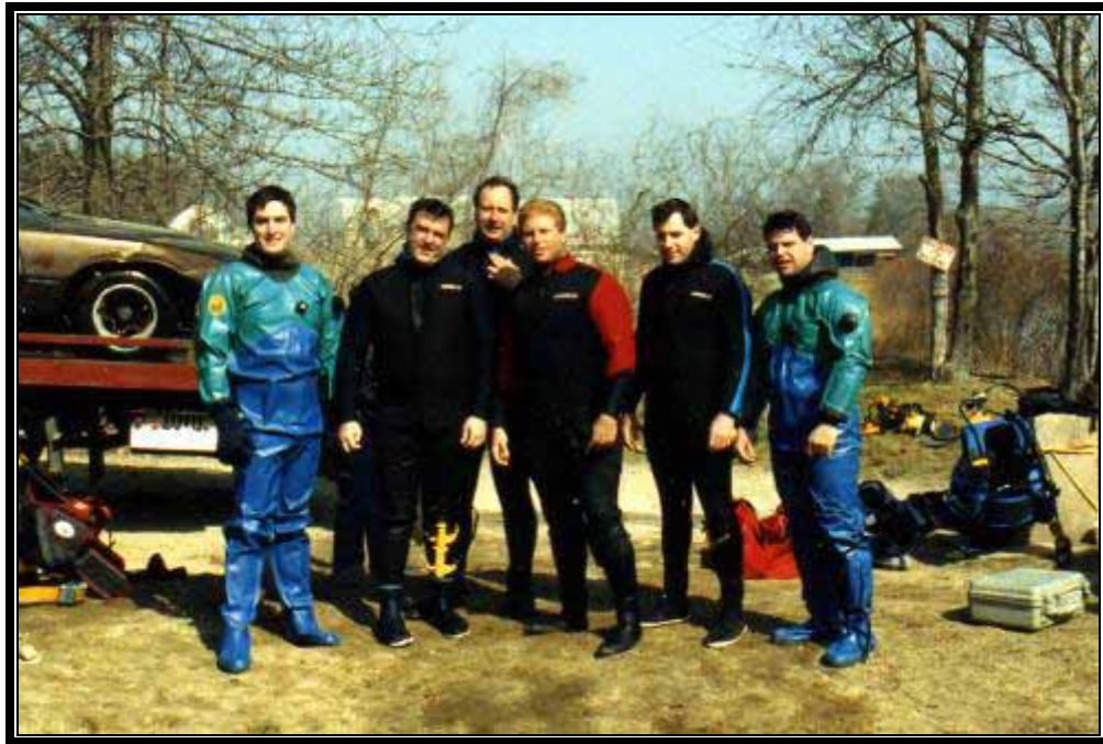
Cranston police divers at the Curran Reservoir after recovering a stolen car. March 16, 1990