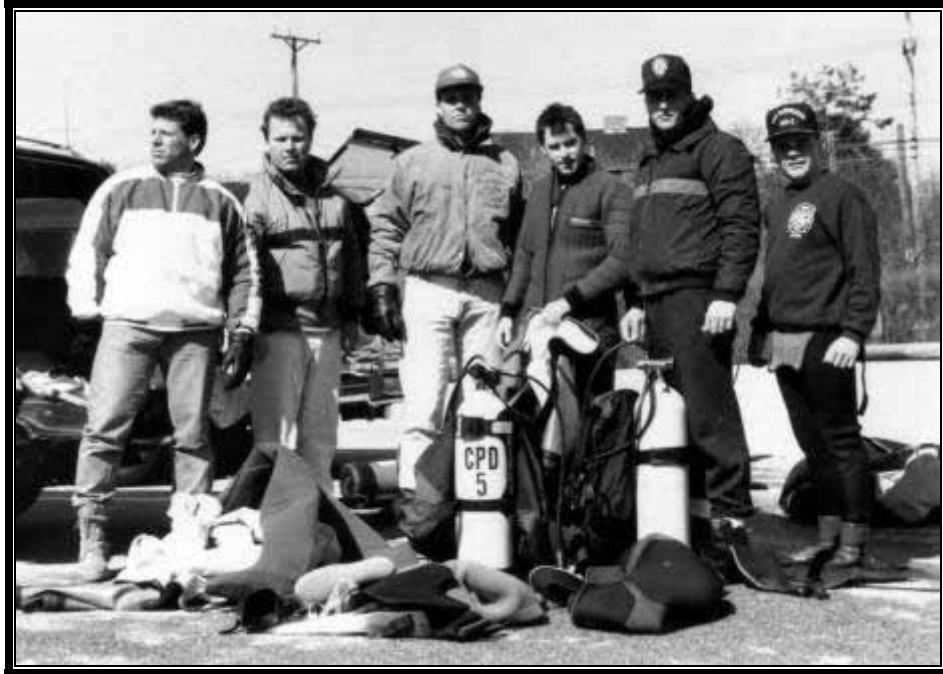
Cranston police divers 1991