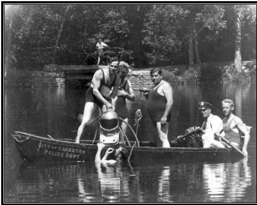
Cranston divers practicing on Meshanticut Lake, circa 1933.

Photographic evidence suggest that the Cranston police used such a diving set-up in the early 1930's, although no records survive that relate to an organized dive team.