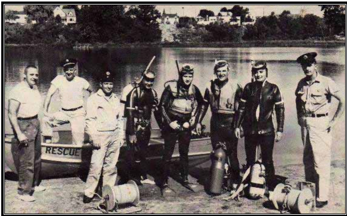
Emergency Service Divers, circa 1963