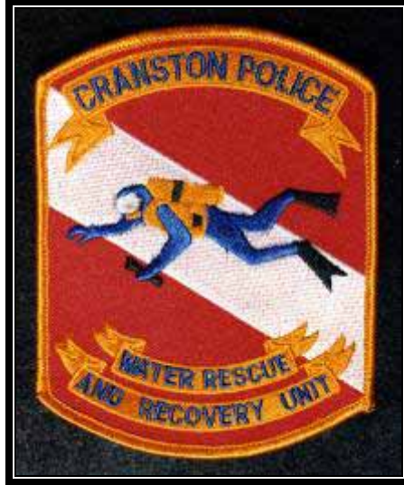
Dive Team patch worn on windbreakers and work suits. First worn January 1989.