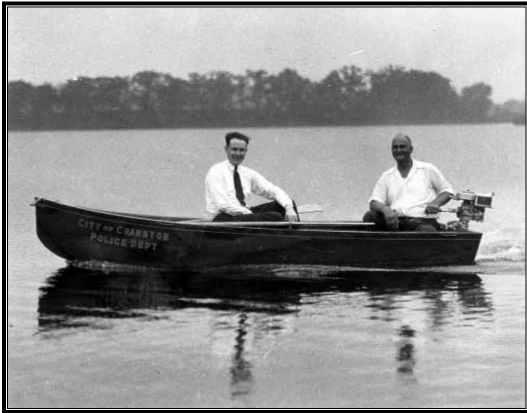
The police department boat on Randall's Pond, 1925

In 1925, the Cranston police obtained a steel boat for water search and rescue operations in the city. The boat was 12 to 14 feet long and could be towed behind the department's patrol wagon/ambulance.